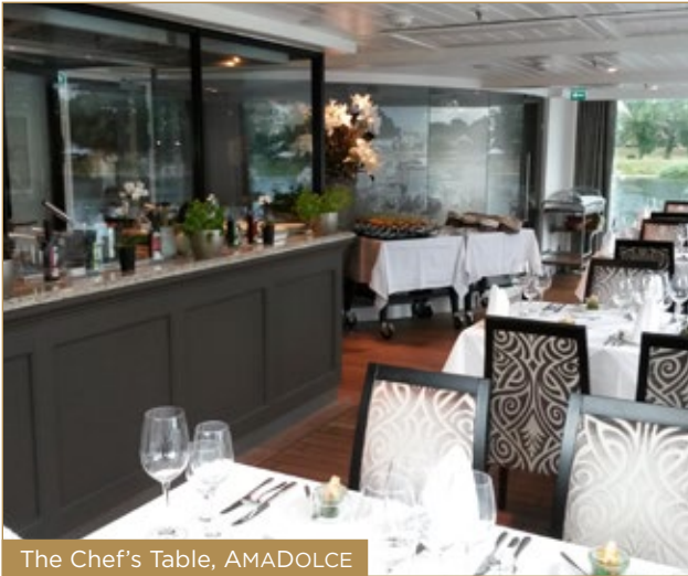
The Chef’s Table, AMADOLCE