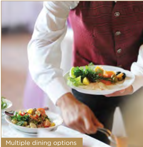
Multiple dining options

The extraordinary AmaMagna is redefining the river cruise experience while sailing on the Danube River. Experience the ultimate in luxury, whether you're exercising in the expansive Zen Wellness Studio or enjoying the views from the full balcony in your stylish suite. With five bars, four unique restaurants – including the new AI Fresco restaurant and Jimmy's, a warm family-style venue – a heated sun-deck pool and whirlpool, the AmaMagna has quickly become the most luxurious cruise ship on the river.